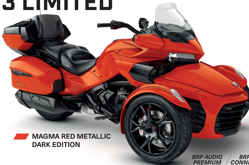
MAGMA RED METALLIC DARK EDITION

BRP AUDIO PREMIUM / BRP CONNECT / UFIT / ECO