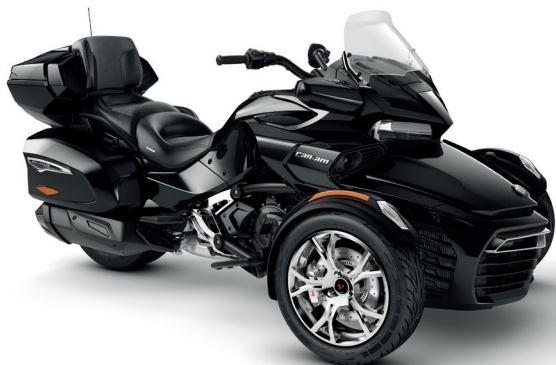
STEEL BLACK METALLIC* CHROME EDITION

*Can-Am On-Road vehicles are engineered to be easy to learn and ride. Check the licence requirements in your country, in most of them you can save the effort of the motorcycle licence to enjoy open-air riding.