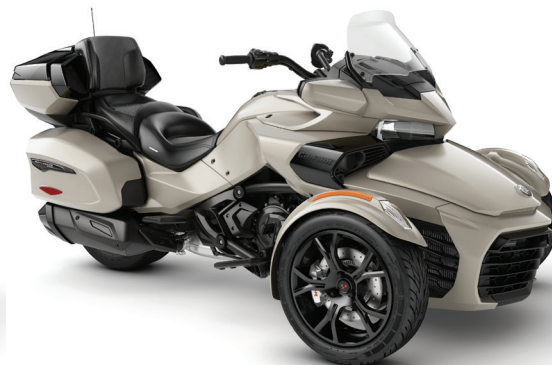
LIQUID TITANIUM DARK EDITION

* Parts and trims available in Chrome or Dark Editions